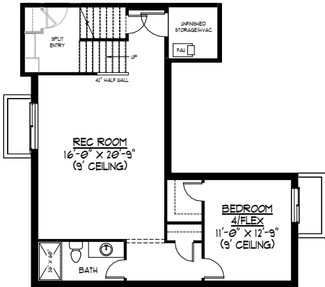
BASEMENT FLOOR PLAN